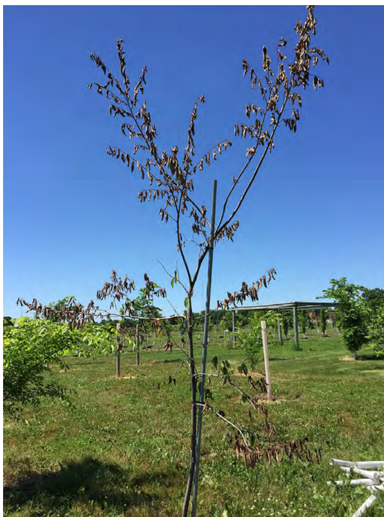
Figure 2.—A representative tree in the early inoculated group at 3 weeks post inoculation displaying permanent wilt in a majority of the crown.

Disease symptoms were assessed every 2 weeks following inoculation. Disease ratings were based on the percentage of the crown exhibiting permanent wilt (Fig. 2). Ratings were made on a 1–6 ordinal scale: 1=0 percent wilt; 2=1 to 25 percent wilt; 3=26 to 50 percent wilt; 4=51 to 75 percent wilt; 5=75 to 99 percent wilt; and 6=100 percent wilt. Area under the disease progress curve (AUDPC) was measured using the mean disease severity ratings at 2, 4, 6, and 8 weeks post inoculation for each treatment. Calculating AUDPC is a useful method to determine disease intensity over time (Campbell and Madden 1990, Shaner and Finney 1977).