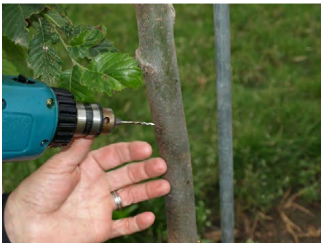
Figure 1.—A drill was used to make a wound 0.5 m above the ground for inoculations.

There were three treatments based on when they were to be inoculated: early, mid, and late season. Each treatment contained eight trees, five randomly selected trees from the Minnesota, seed source and three randomly selected trees from the Ontario seed source. Due to limited plant material, the mid inoculation treatment had six trees from the Minnesota seed source and only two from the Ontario seed source. For each treatment, six trees were inoculated with a spore suspension and one tree from each of the two seed sources were inoculated with sterile water to serve as controls. The early season inoculation group was inoculated on May 26, 2016 (40 days after budbreak), the midseason inoculation group on June 23, 2016 (68 days after budbreak), and the late season inoculation group on August 4, 2016 (110 days after budbreak). Inoculations were made using a drill method modified from a study by Townsend et al. (2005). Briefly, trees were inoculated by drilling a 4 mm deep hole with a 2.4 mm diameter drill bit 0.5 m above the ground on the main stem (Fig. 1). Twenty-five \mu m of the spore suspension containing 1 \times 10^6 spores/ml were injected into the hole using a micropipette and sealed with Parafilm M® (Bemis Co., Neenah, WI) to avoid desiccation.