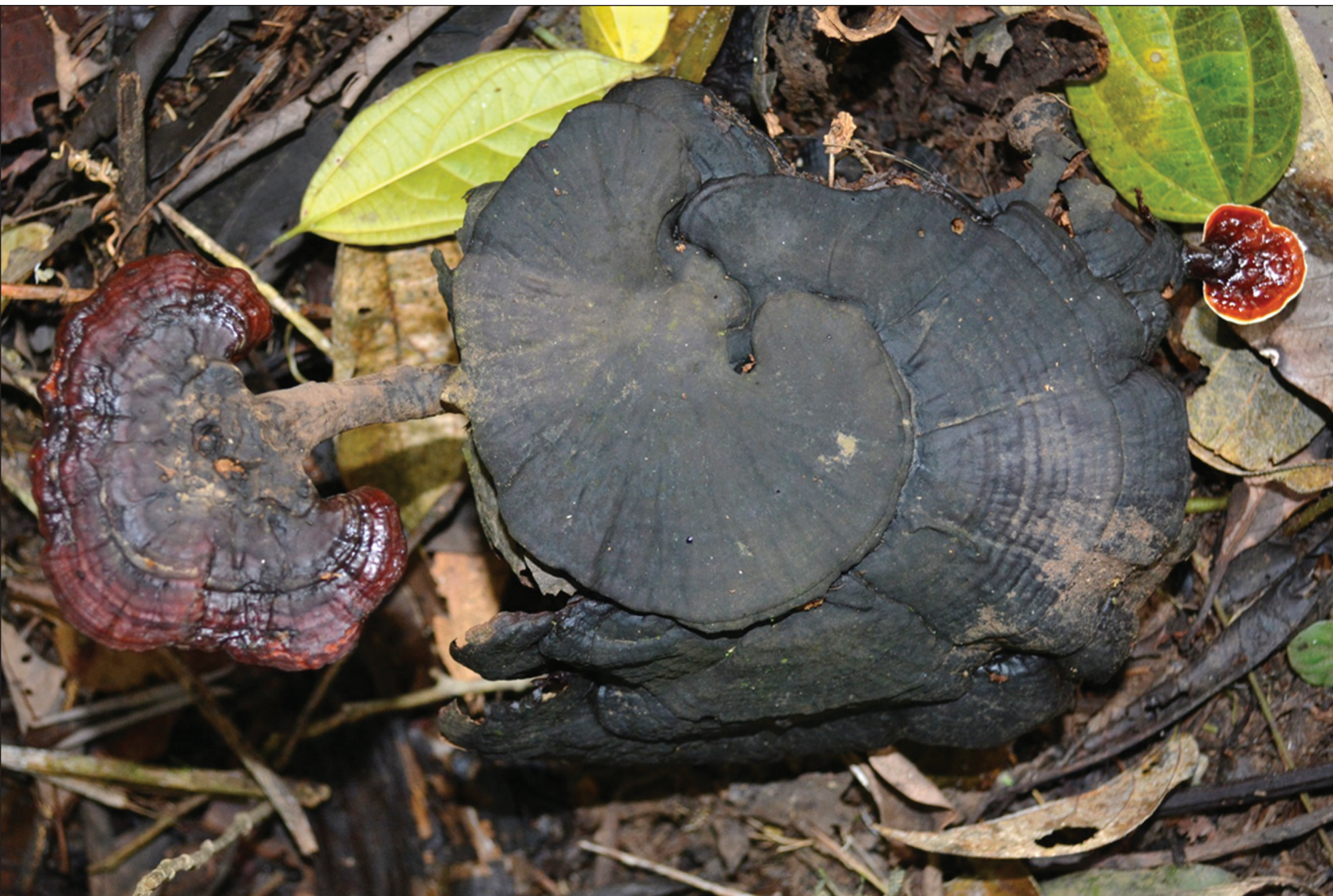
Figure 6. A Ganoderma found in the Ecuadoran Amazon at the Limoncocha Biological Reserve producing two new fruiting bodies at the edge of an older (black) basidiocarp.

the readers of FUNGI magazine out looking, new examples will undoubtedly be found and maybe mushroom growers producing Ganoderma will be inspired to someday cultivate a finely crafted version of a fingered Ganoderma necklace or a really creepy evil demon hand to rival the old ones recorded in the mycological historic record. We eagerly wait for such an event.