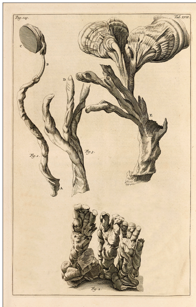
Figure 2. Illustration from an 1826 article by the Nees von Esenbeck brothers where they described a new species, Polyporus pisachapani . This Ganoderma with monstrous re-growths resembling fingers was drawn life size (30 inches in length). The species name pisachapani translates to “hand of the evil demon”. The illustration, a foldout in the publication, was digitally manipulated to remove the folds and age spots that occurred on the original drawing.