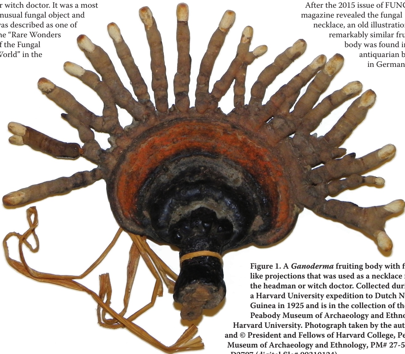
Figure 1. A Ganoderma fruiting body with finger-like projections that was used as a necklace for the headman or witch doctor. Collected during a Harvard University expedition to Dutch New Guinea in 1925 and is in the collection of the Peabody Museum of Archaeology and Ethnology, Harvard University. Photograph taken by the author and © President and Fellows of Harvard College, Peabody Museum of Archaeology and Ethnology, PM# 27-56-70/D2797 (digital file# 99310124).

After the 2015 issue of FUNGI magazine revealed the fungal necklace, an old illustration of a remarkably similar fruiting body was found in an antiquarian bookshop in Germany called