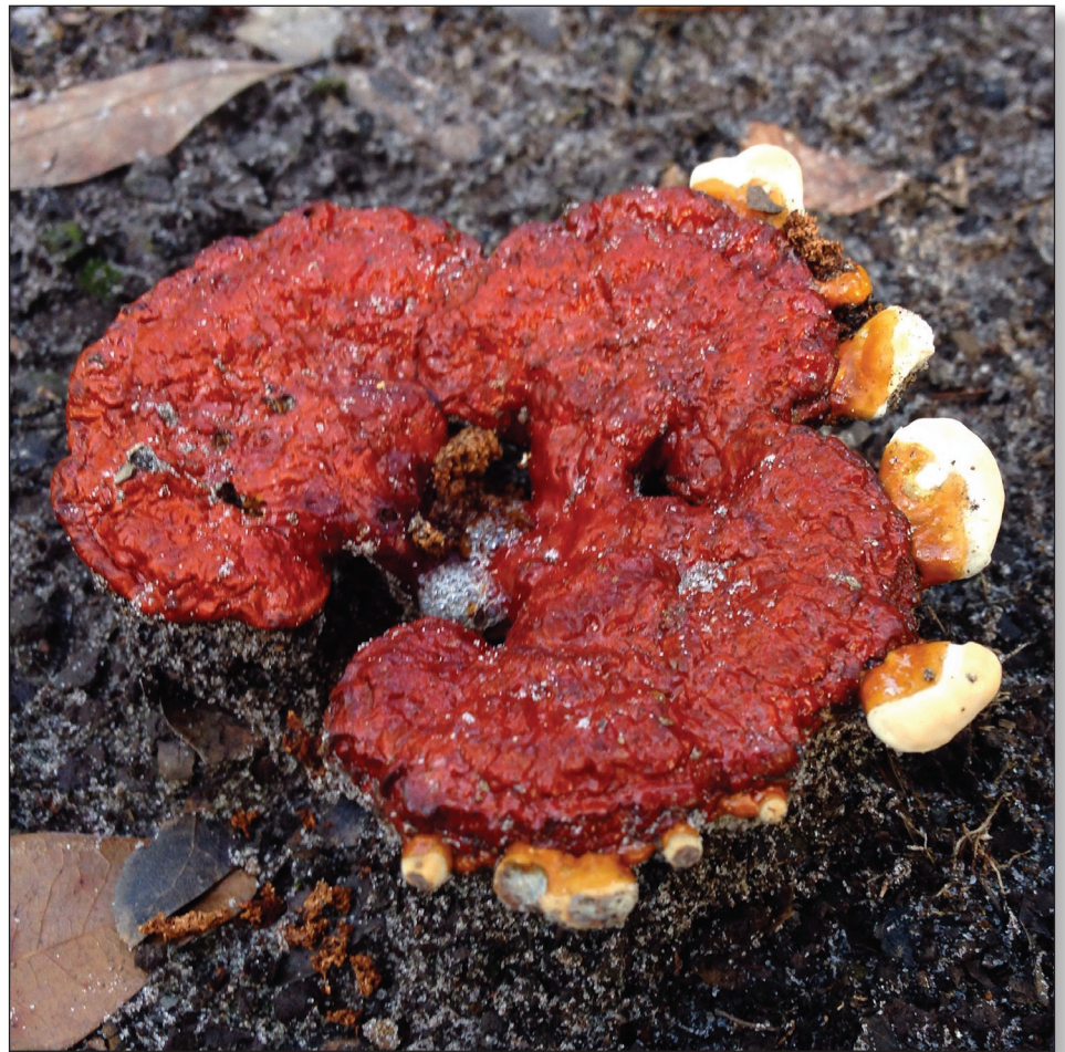
Figure 4. Ganoderma with re-growth at the edges of the pileus found in Georgia after flooding covered the original fruiting body.