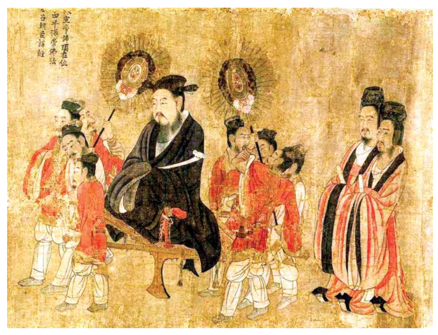
Figure 4. One of the earliest depictions of a Ganoderma scepter or ruyi is in a scroll entitled "The Thirteen Emperors" painted in the 7th Century by Yan Liben. This section of the scroll shows Emperor Xuan of Chen wearing a dark robe and holding a Ganoderma scepter. Denman Waldo Ross Collection, Museum of Fine Arts, Boston.

protect against disease when used in traditional medicine, it is also considered to be a symbol of long life, good health, good luck and prosperity. If a glossy Ganoderma with a normal size stipe conjures up a representation of these attributes, one can only assume that Ganoderma with exceptionally long stipes are used for even more powerful imagery. Finding Ganoderma with very long stipes in nature is possible but they are rare. As alternative to these scarce naturally-grown Ganoderma, carvings of Ganoderma with a long stipe were made from wood and bamboo (Figure 3). They were held as scepters or displayed as a talisman that relayed the symbolic message of providing protection, the very best of health, an abundance of good fortune and an extended life with even the possibility of immortality. One of the earliest