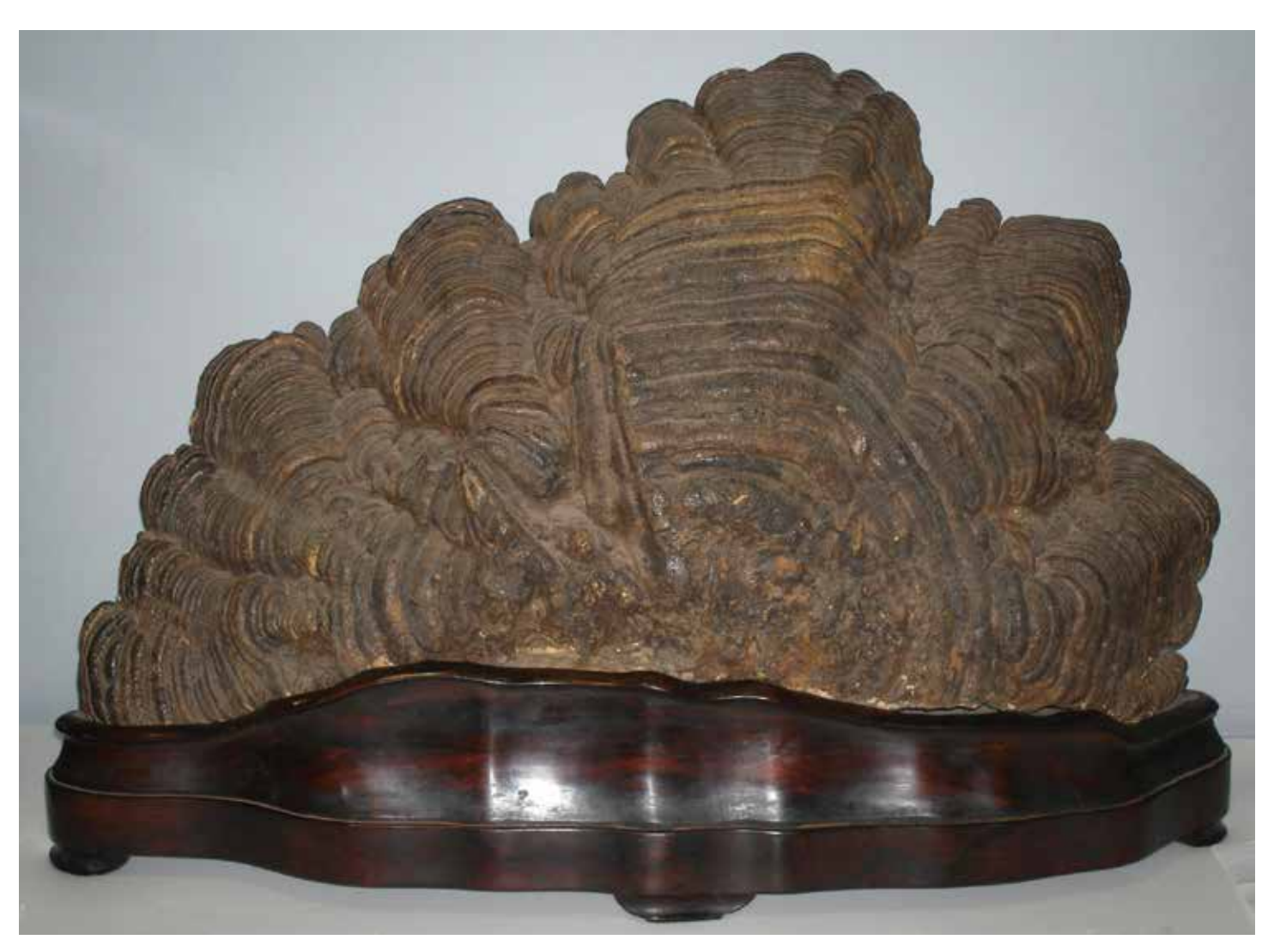
Figure 7. Examples of Ganoderma with unusual shapes and interesting features that were mounted on a wooden base and displayed. Some of the wooden bases were finely carved with images of Ganoderma as seen in the top photo. These objects are beautiful forms of natural art and they also are symbols to bring good health, prosperity and luck. From a private collection.

As you can see in the figures, the historic fungi referred to as lingzhi had a broad species concept and both the glossy Ganoderma (Ganoderma lucidum complex) and Ganoderma applanatum types could be considered lingzhi . Keep in mind that during the reign of the Qianlong emperor, binomial nomenclature was just beginning and the genus name for fungi was often just called "Fungus." Differences in fruiting body characteristics were certainly noted and the stipitate laccate Ganoderma appeared to be used most often. However, when it came to symbolic uses by the Qianlong emperor both appeared to be acceptable. In 1781, the name Boletus