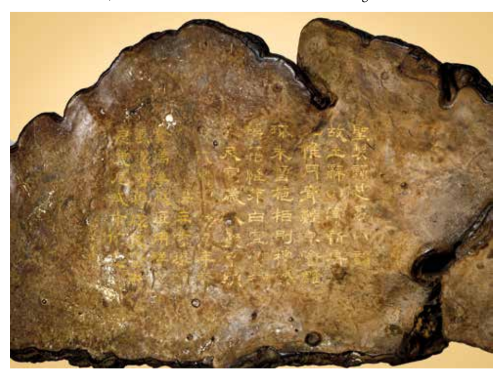
Figure 6. (above) An unmounted Ganoderma with a poem composed by the Qianlong Emperor and painted with gold paint on the pore surface by scholar and calligrapher Ruan Yuan. The poem is titled "Eight rhymes on lingzhi screen by his honerable magesty". (below) This Ganoderma may have been in a cabinet or just placed on a wooden base for display.

contemplate their fine detail and beautiful characteristics. There are several examples of very old Ganoderma that were used in this way (Figure 7). Often the wooden base holding the Ganoderma is carved with images of Ganoderma