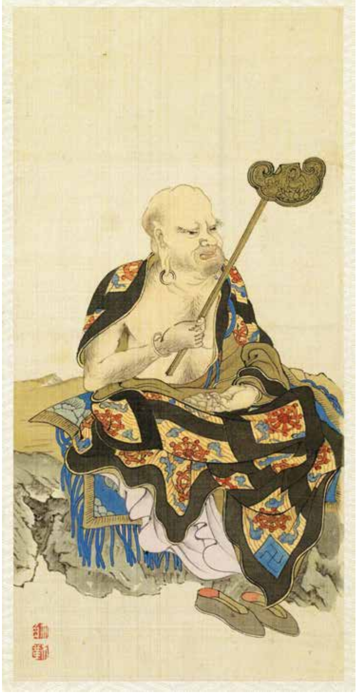
Figure 2. Two paintings of Luohans or disciples of Buddha holding Ganoderma . These images were painted by Shodo-sho in 1851 and are depictions of the Luohans first made by Guan Xiu in 894. The Qianlong Emperor greatly admired the paintings of the 16 original Luohans which were kept at the Shengyin Monastery. The originals were destroyed in 1850 and these were repainted in 1851.

world that most people were forbidden to see. Since the 1700s, very few people have been in this restricted area of the Forbidden City or seen the treasures that are inside. When the last emperor left the Forbidden City in 1924, the buildings in the Qianlong Garden were closed and they have never been opened to the public. Currently, the buildings with their majestic interiors are being restored so that the world can have the