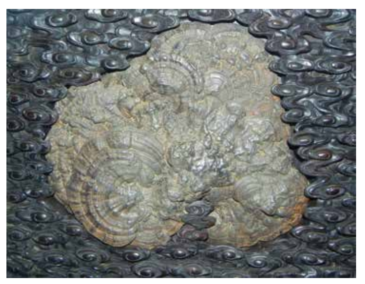
Figure 5. The Qianlong Emperor's imperial fungi. Large Ganoderma were mounted on zitan cabinets for display in the palace. These cabinets or screens were designed to be placed on tables. The top left photo shows a Ganoderma mounted on a plain wooden front with stylistic images of Ganoderma carved along the bottom. The top right cabinet has a fruiting body held and surrounded by colorful cloisonné decorative work. The bottom left and enlarged in the bottom right photo shows another large Ganoderma held by many carved cloud-shaped patterns. This cabinet also has the stylistic Ganoderma carved along the bottom frame. Each cabinet has a poem written by the emperor on the back. The top left cabinet's poem is dated 1774.